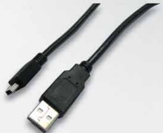
USB to mini USB cable GT-USB