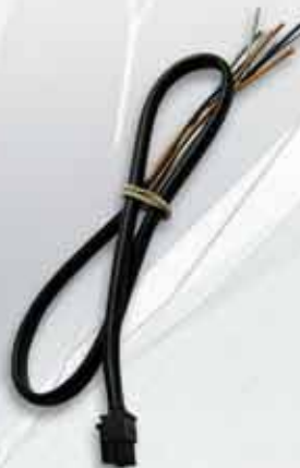
Microfit to AUX / Audio Cable KA13GT