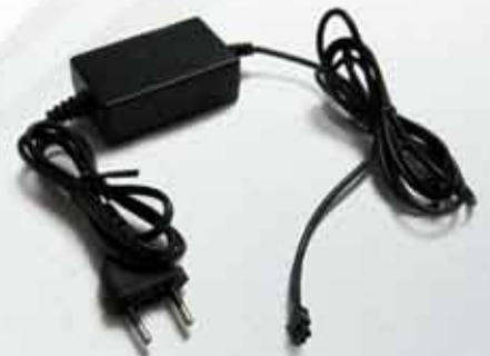
Power Supply PS100