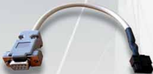
Microfit to RS-232 DB9 Female Cable KA01MFT