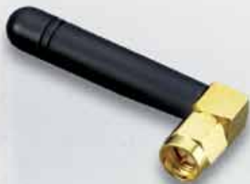
Taoglas TG.22 GSM Antenna